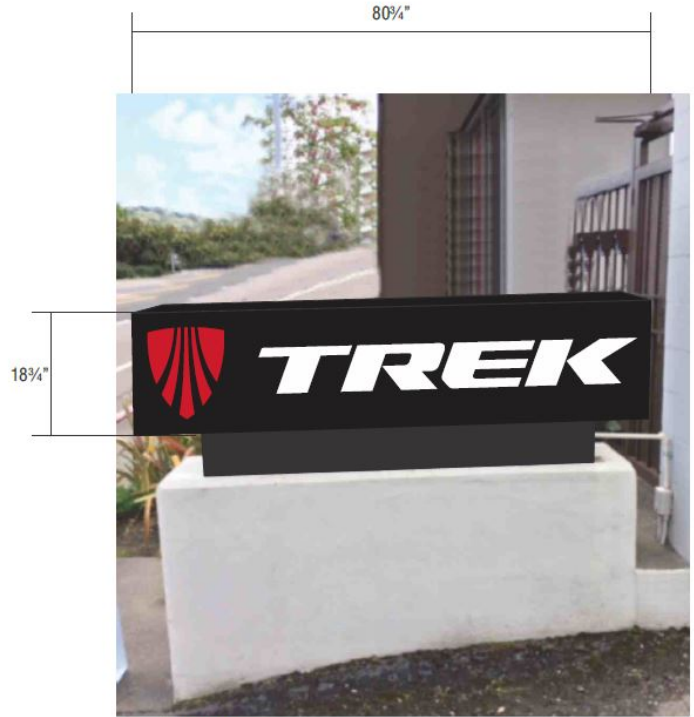
A PROPOSAL SQ. FT.: 10.50