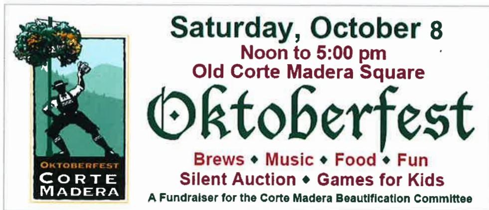
Proposed 3' x 7' Horizontal Banners