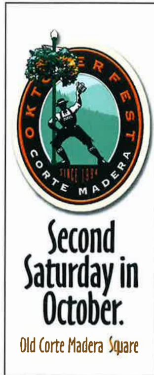
Proposed 18" x 48" Vertical Banners to be displayed on light poles