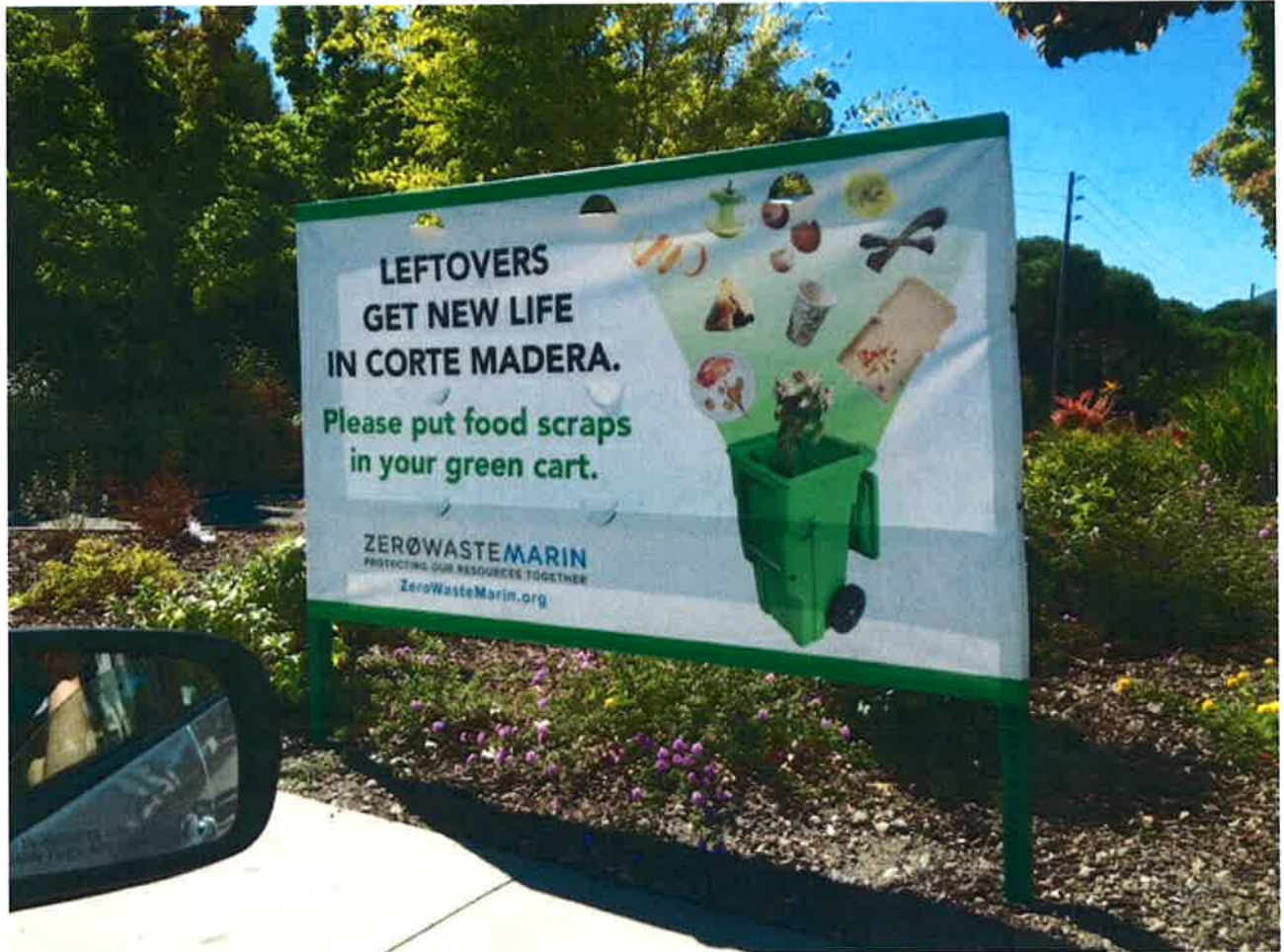
Design of previous banner used in Corte Madera