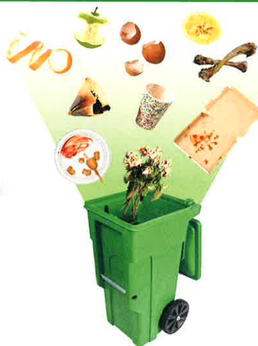
Design of previous banner used in Corte Madera

ZERØWASTEMARIN PROTECTING OUR RESOURCES TOGETHER ZeroWasteMarin.org