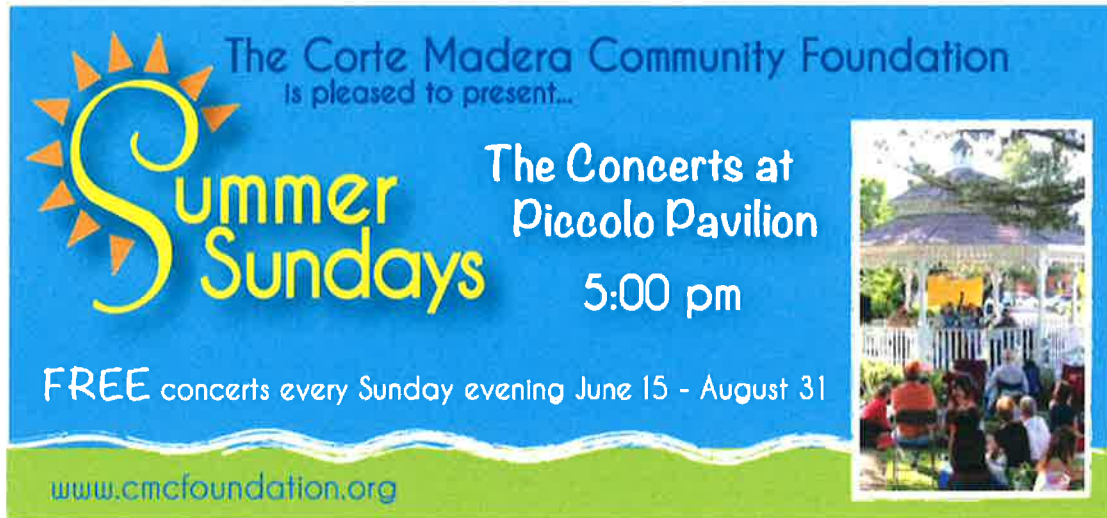
Horizontal Banner Sign, 3'-tall by 7'-wide Example of Previous Banner