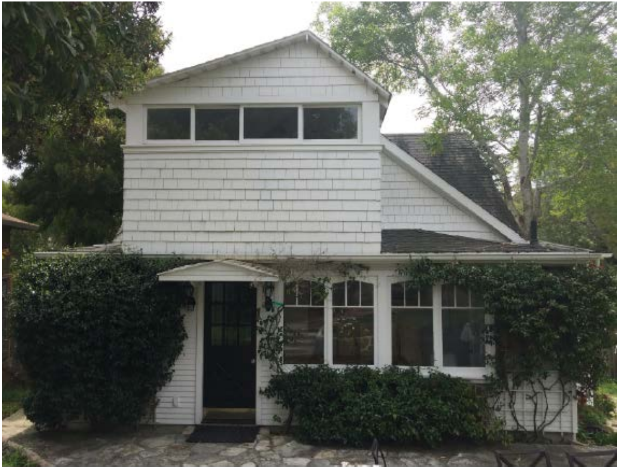
Existing North Elevation