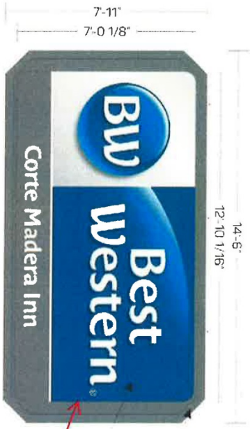
GRAPHIC DETAIL SCALE 3/4" = 1'-0"

NEW S/S WOOD WRAP PAINTED TO MATCH MP 13901 GREYS LAKE