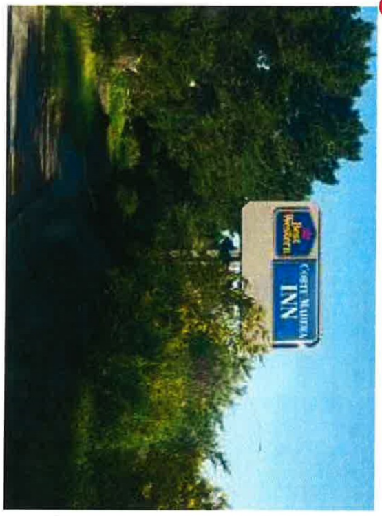
EXISTING SIGN SIZE 7'-11" TALL x 14'-6" WIDE PYLON