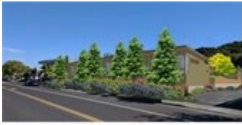
Casa Buena Drive looking East