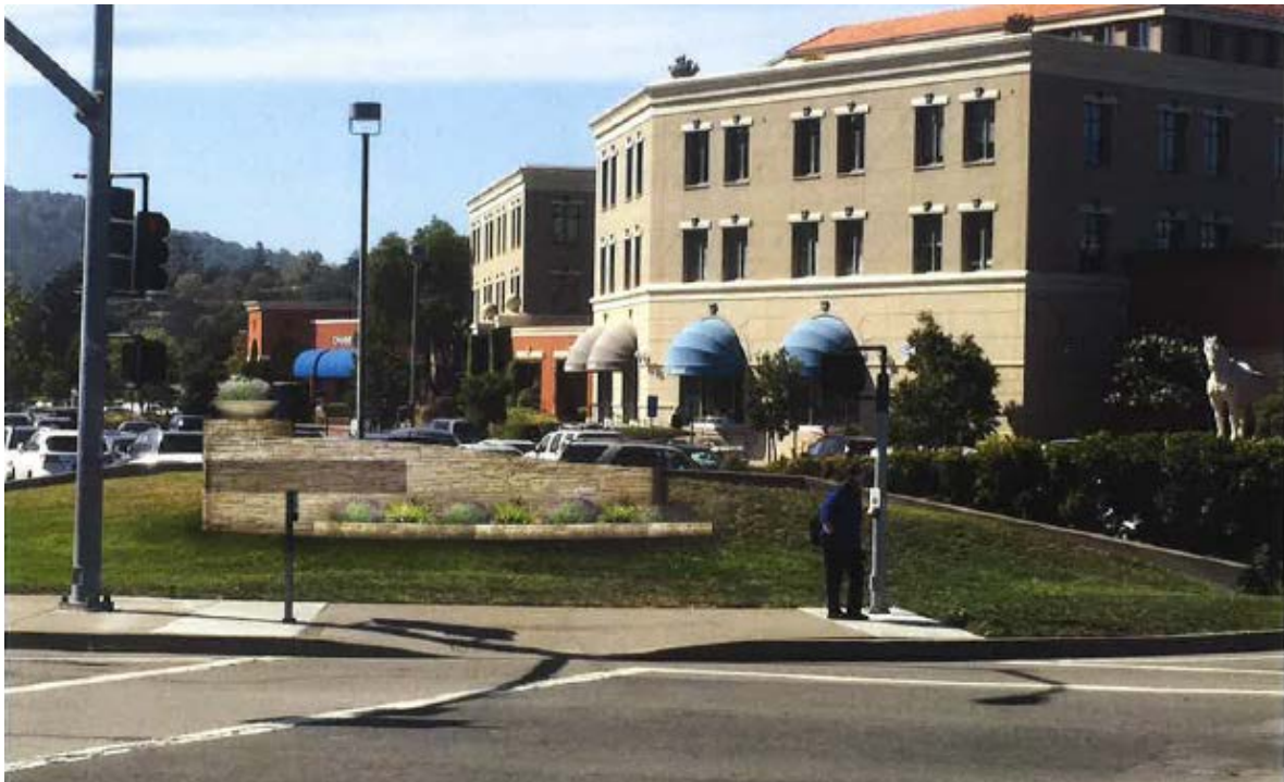
Visual Simulation of Proposed Monument Sign at Southeast Corner of Town Center