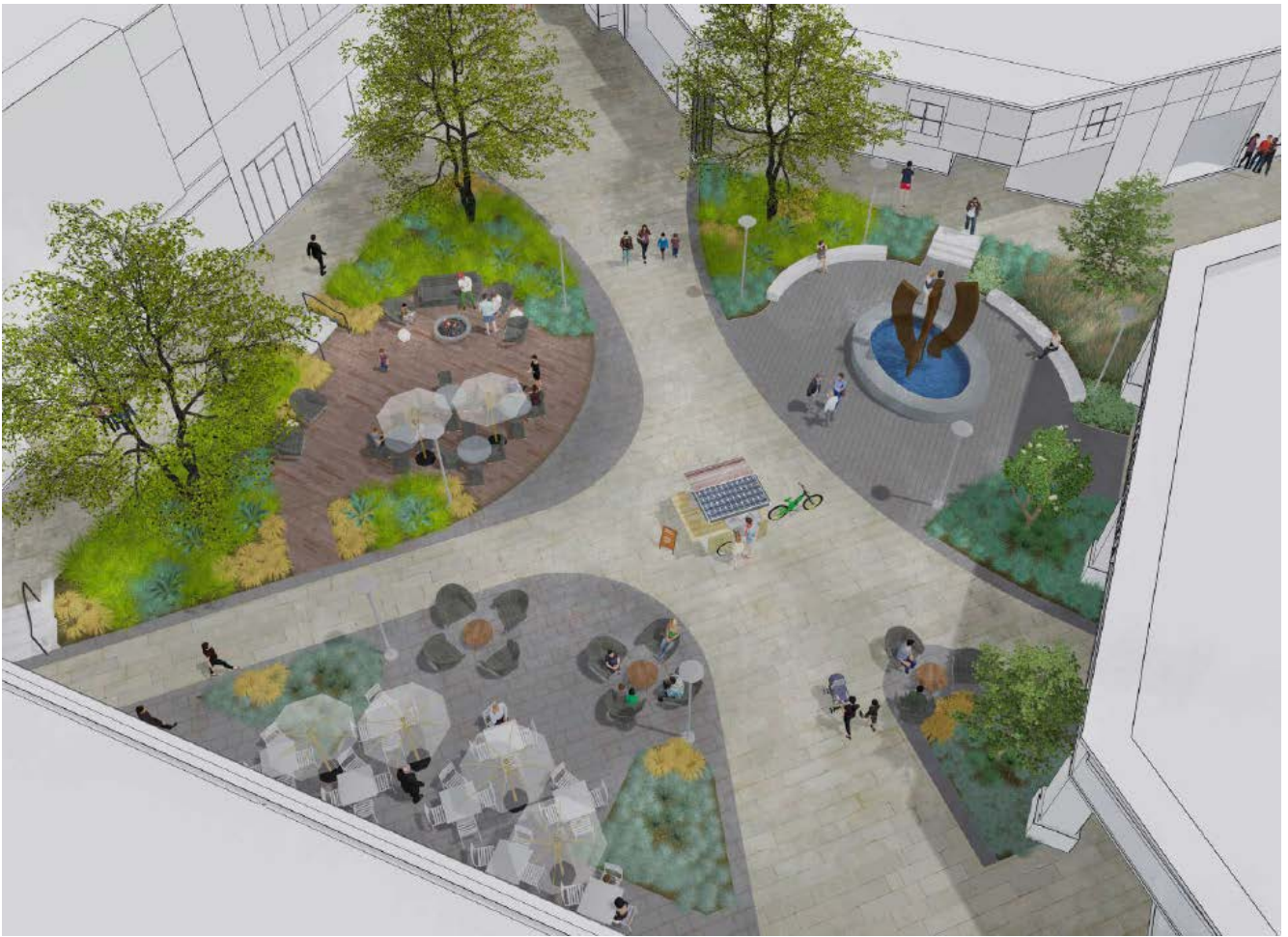
Proposed Renovations of Center Court