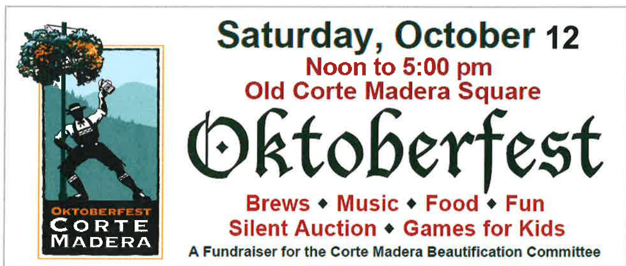
Proposed 3' x 7" Horizontal Banners