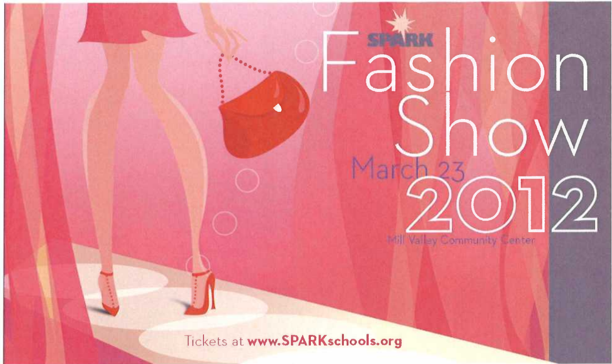
Proposed Sign, 3' x 5'