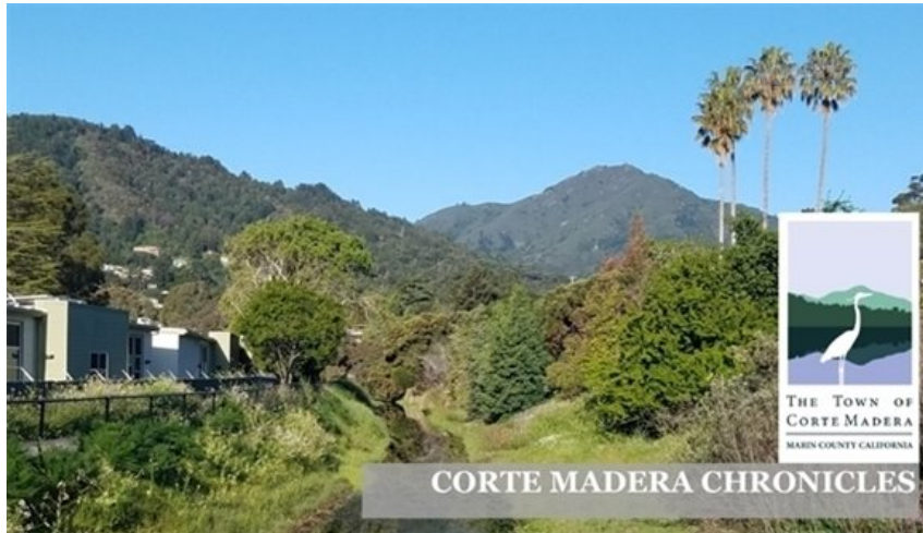
The Town of Corte Madera's Newsletter for December 20, 2019