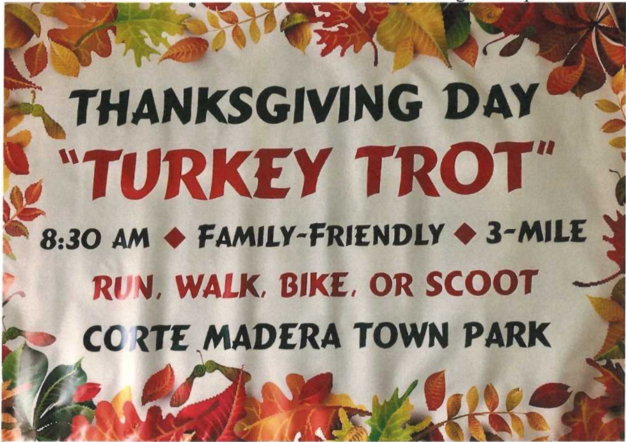
Two 4'-tall by 6'-wide banners